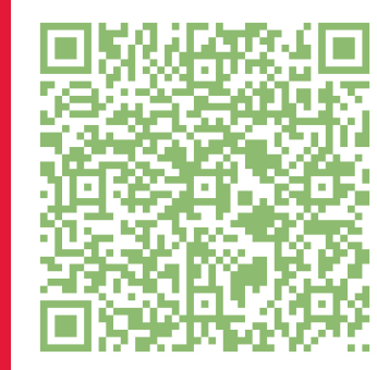
Policies adopted by UNL and the Board of Regents

It is the policy of the University of Nebraska– Lincoln not to discriminate based upon age, race, ethnicity, color, national origin, gender– identity, sex, pregnancy, disability, sexual orientation, genetic information, veteran's status, marital status, religion or political affiliation.