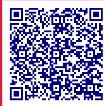
TIPS Report Incident

Scan the QR Code to go directly to the webpage!